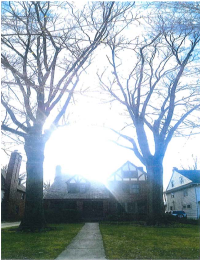
A pair of Pin Oaks at 3290 Elsmere Road, 2013

A pair of beautiful trees received the Heritage Tree Award for their unusual form and size – two Pin Oaks who live in the front yard of 3290 Elsmere Road. Planted in the roaring 1920s, today they reach 80 feet in height and sporting 90-foot crown spread supported by 35 and 42 inch trunks. The Pin Oak ( Quercus palustris ), also known as Swamp Oak or Swamp Spanish Oak, belongs to the group of the red oaks and has reddish-bronze fall coloration. It is native to Ohio, the Mid West and Mid-Atlantic States.